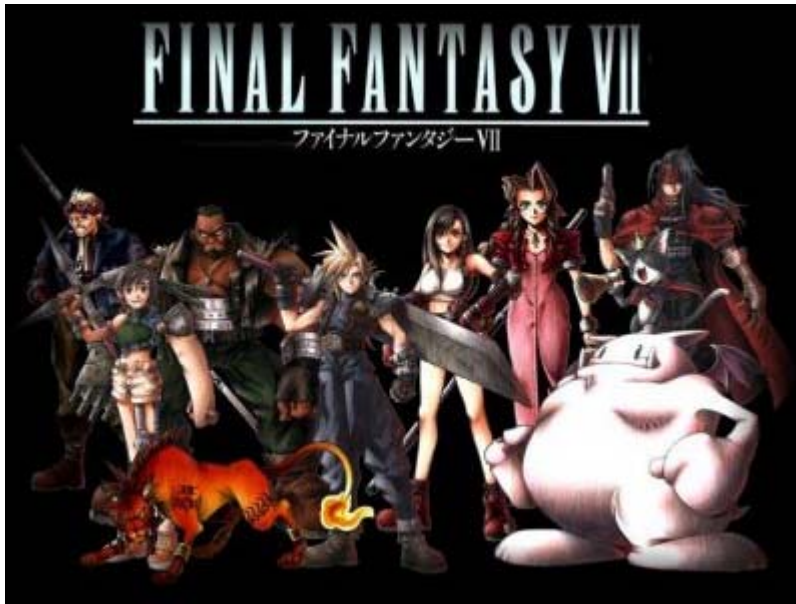
From left: Cid, Yuffie, Red XIII, Barrett, Cloud, Tifa, Aeris, Cait Sith, Vincent